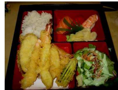
Sushi Bento Box