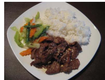
Beef Teriyaki Entree