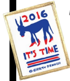
← Brett Bender "2016 It's Time" Lapel Pin $8