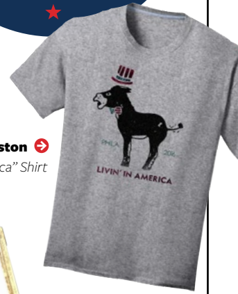
Duke & Winston → "Livin' In America" Shirt $23

smart souvenirs Merchandise is available at phldncshop.com and the Comcast Center pop-up from June 29th through the duration of the DNC.